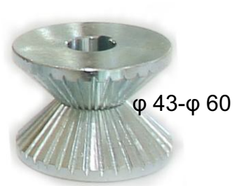
Fig 6 ( 圖 6 )