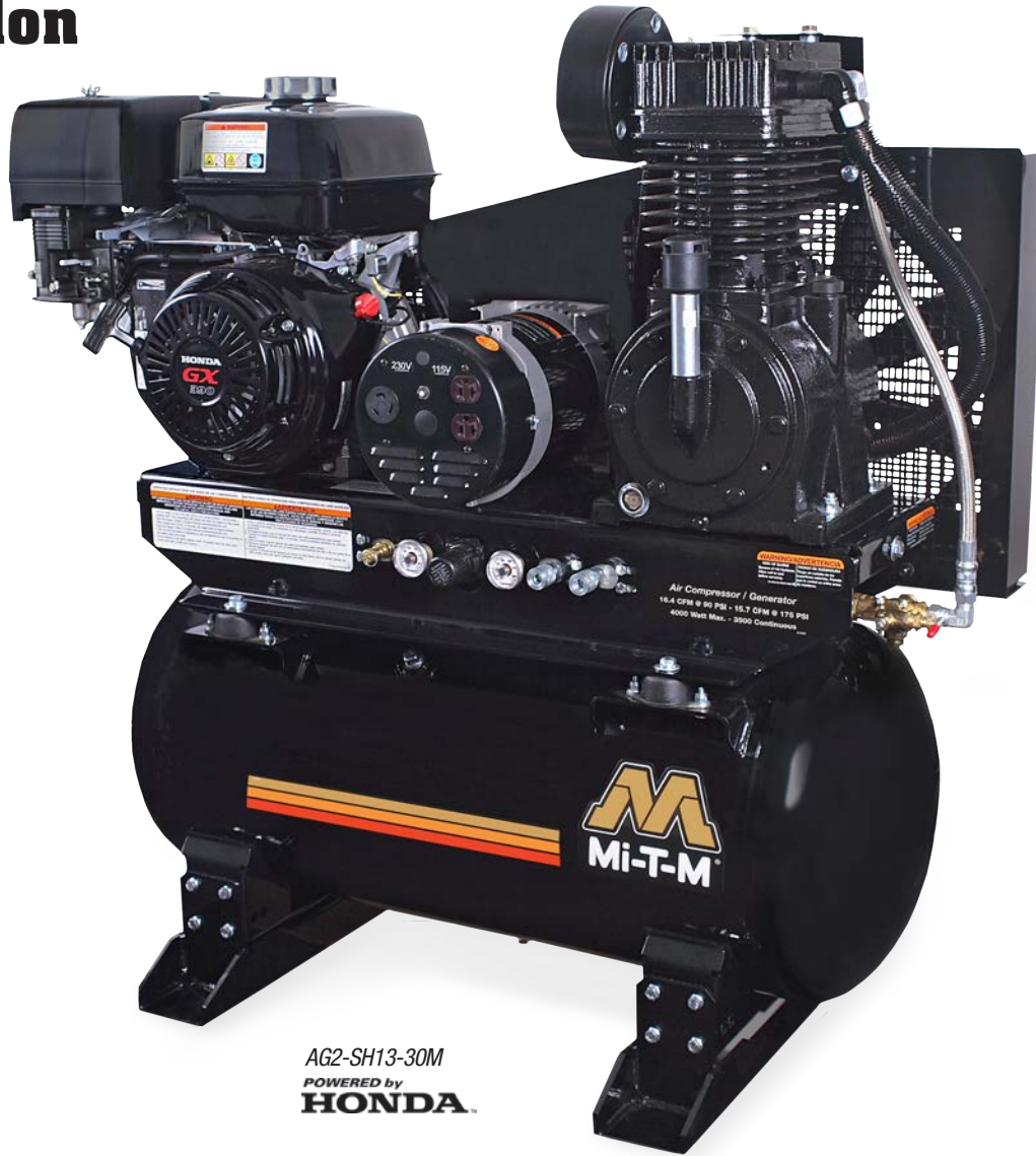
AG2-SH13-30M POWERED by HONDA