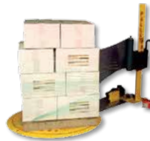
PalletPal Semi-Automatic Stretch Wrapper