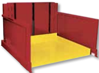
PalletPal Roll-On Leveler