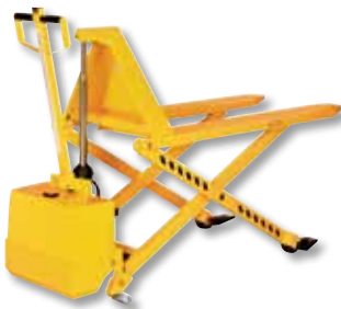
PalletPal Lift Truck