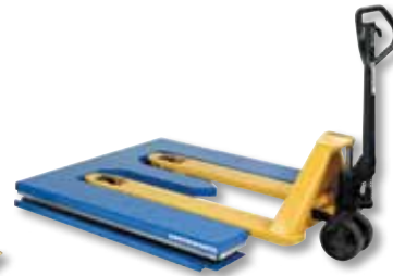
PalletPal Roll-In Leveler