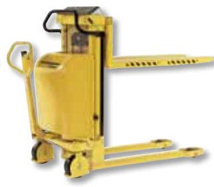
PalletPal Mobile Leveler