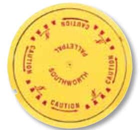
PalletPal Disc Turntable