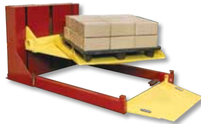
PalletPal Roll-On Leveler with Turntable