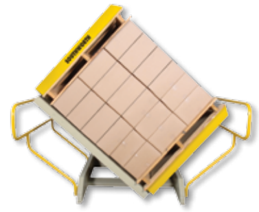
PalletPal Pallet Rotator/Inverter