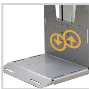
Large 20" x 16" platform with load backrest and angled lip.