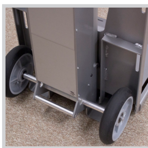
Kick axle for easy tilting of LNB-2 for load transport.