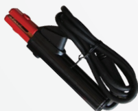
200 Amp Stinger